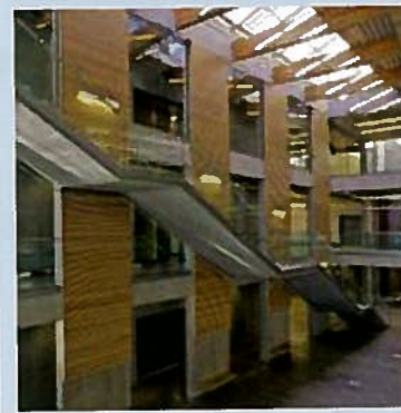
Atrium & inter-connecting staircase, Kwantlen University College Library.

This new 57,000 sq.ft. facility is the essence of a modern library and provides a dynamic centre dedicated to successful learning.