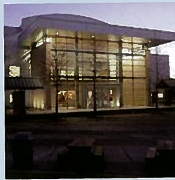
Front Entrance, Kwantlen University College Library at dusk.