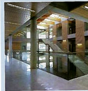
Atrium, Kwantlen University College Library.

Only non or low VOC (volatile organic compound) emitting materials were used in interior adhesives, sealants, paints, carpets, agrifibers and woods. More than 95% of the virgin wood used in this project is FSC certified.